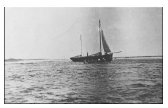
Above - Attempts to refloat the Leviathan.

Below - The skeletal remains of the Leviathan.