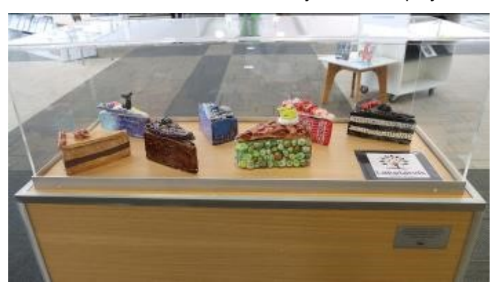
The artwork included 3D cakes with a slice missing and ceramic boxes in the shape of a slice of cake.

To celebrate National Science Week in August, ceramic food artwork from Lakelands Primary was on display.