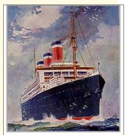
Painting of the SS Leviathan from ship's menu

She was the German ship Vaterland 'Pride of the German passenger fleet,' at anchor in American wa-